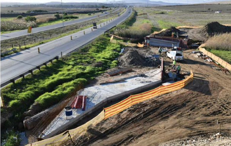
Back to work: With the easing of the lockdown, roadworks around the Potsdam interchange have resumed, aiming for completion by December 2020.

Closing the loop The loop ramp will provide a link from Malibongwe Drive onto the N7, off the Potsdam interchange. Once completed, it will improve the traffic flow onto the N7, and traffic will have a free flow from Parklands, Sunningdale and Rivergate onto the N7 heading in a southerly direction. Some of the work to date includes dualling of Sandown Road, from Gie Road to Malibongwe Drive (M12), construction of a bridge over the railway line, dualling of Malibongwe Drive (M12) from Sandown Road to the Potsdam interchange (N7/M12), and relocating a sewer pipeline and water